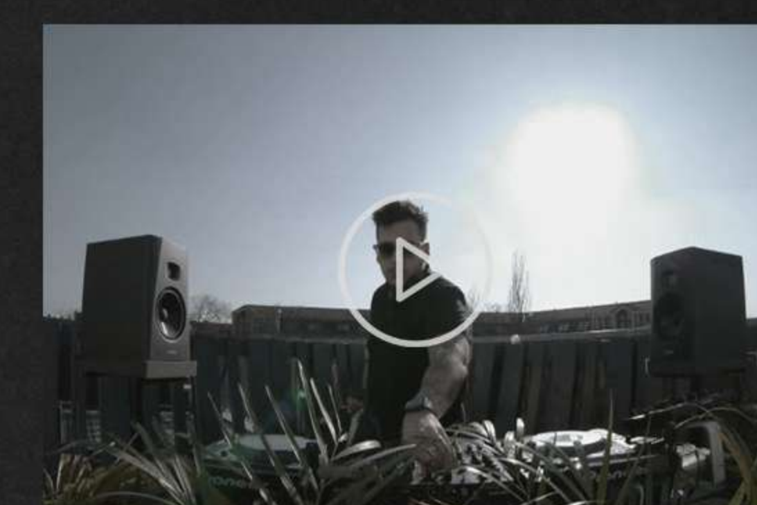
BALCONY STREAM 2020