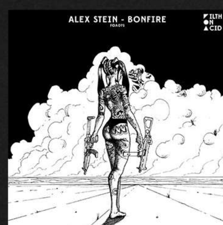
BONFIRE FILTH ON ACID